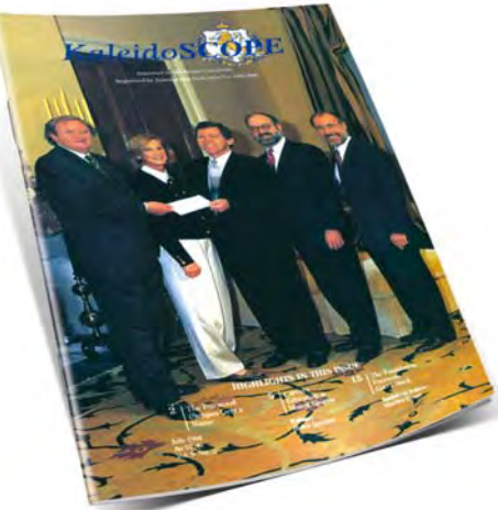
KaleidoSCOPE July 1994