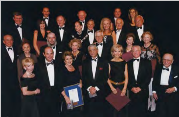
Inaugural Leon Fink Memorial Award recipients

5 year – $8,000,000' Capital Campaign launched by the Hon. Peter Costello, Federal Treasurer.